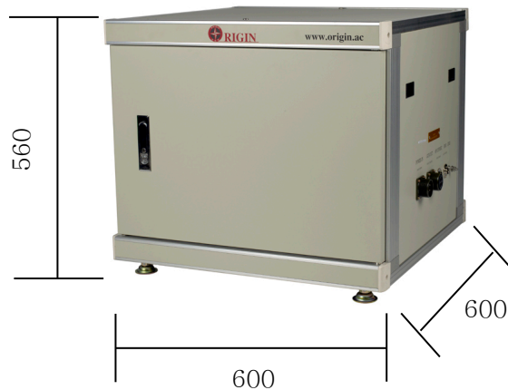
Power supply main